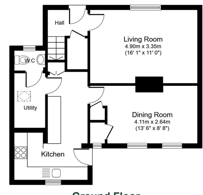
Ground Floor NOT TO SCALE For layout guidance only

Thorner is a most sought-after rural village to the north east of Leeds, situated five miles from the city. There is a strong community spirit and a variety of recreational facilities. The London/Edinburgh A1 motorway is only a five minutes' drive away at Bramham also easy access to the M1 and M62.